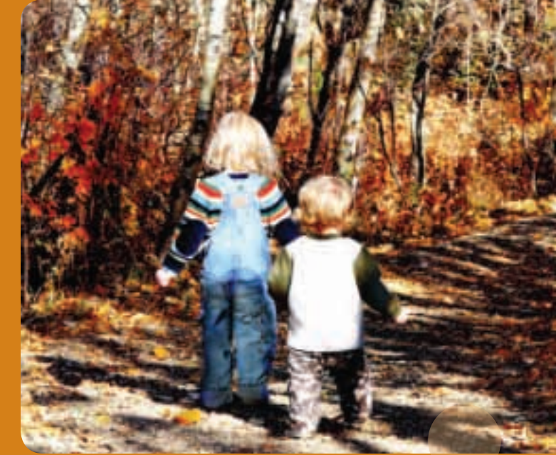
Walk through Kinnaird Ravine