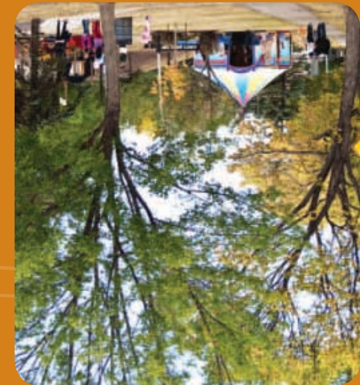
Festival on the Avenue

Funding for this project was provided by the Community Health and the Built Environment Project which was funded by Heart and Stroke Foundation of Canada and the Canadian Institutes of Health Research.