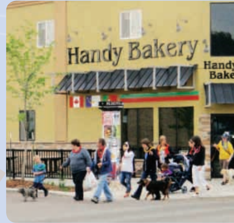
Local dog walking group on 118 Avenue

www.edmonton.ca/walkable Walkableedmonton@edmonton.ca 780-944-5339